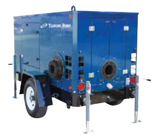
Sound Attenuated Priming Assisted: EPT4-Q