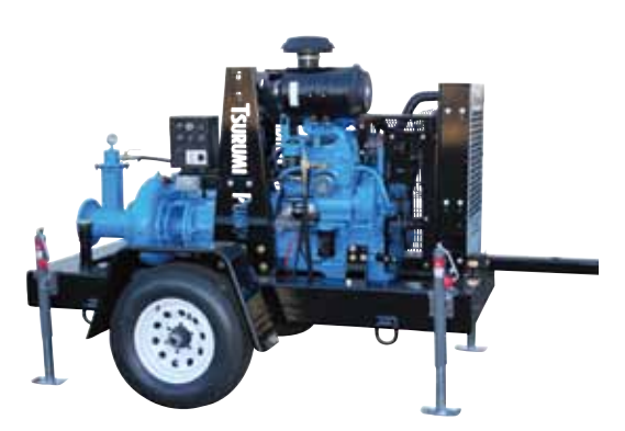
Priming Assisted: EPT4-150